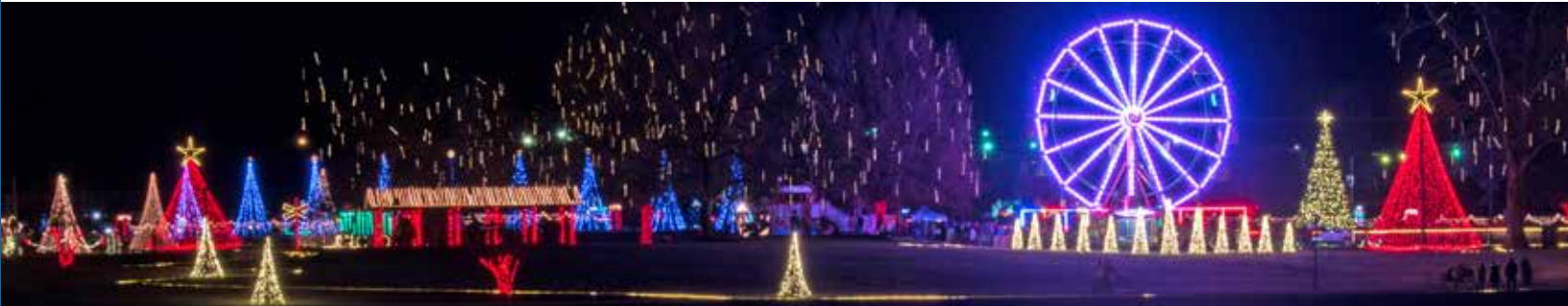
WHITE RIVER WONDERLAND