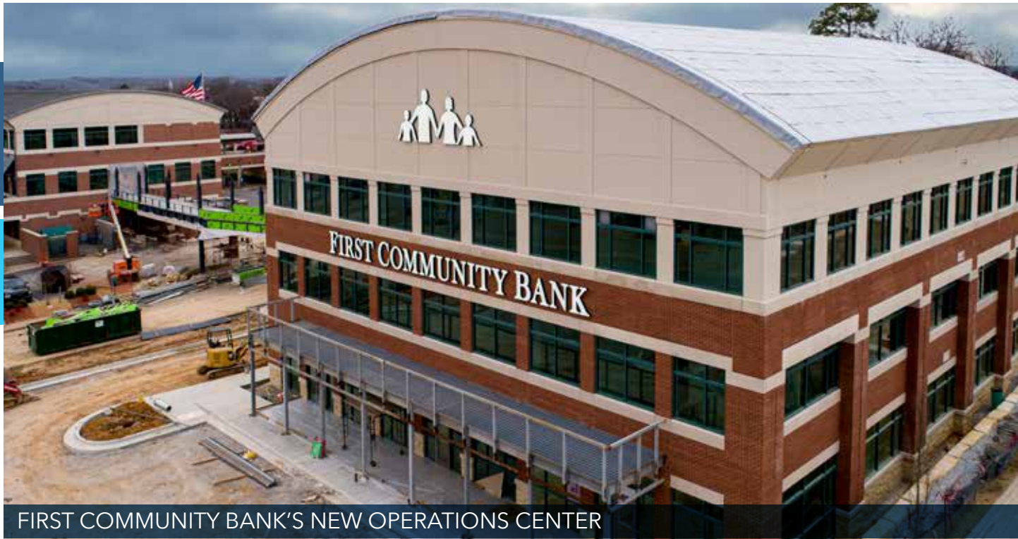
FIRST COMMUNITY BANK'S NEW OPERATIONS CENTER