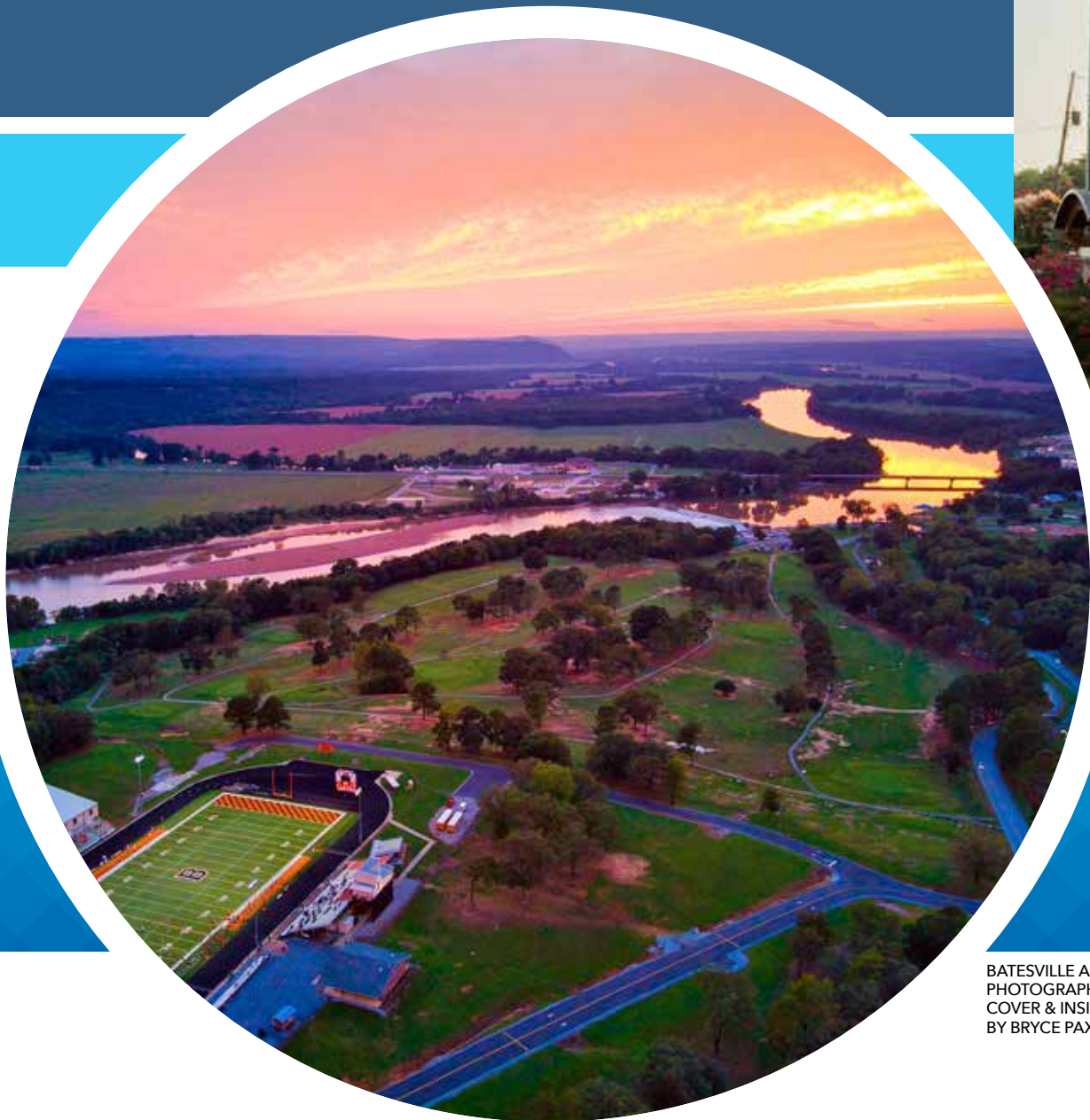
BATESVILLE AREA DRONE PHOTOGRAPHY ON THE COVER & INSIDE COVER BY BRYCE PAXSON