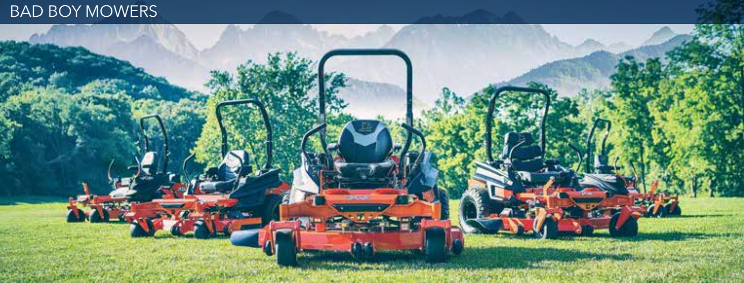
BAD BOY MOWERS

BATESVILLE IS LOCATED IN INDEPENDENCE COUNTY, AR, ONLY 94 MILES NORTH OF LITTLE ROCK & 121 MILES WEST OF MEMPHIS