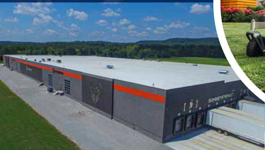
INTIMIDATOR, INC. HEADQUARTERS