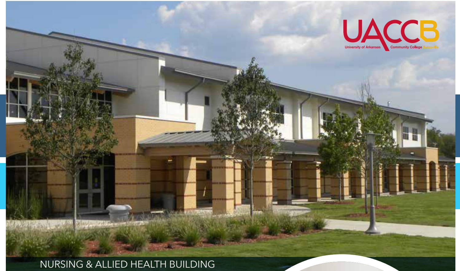
NURSING & ALLIED HEALTH BUILDING

The University of Arkansas Community College at Batesville (UACCB) embraces a practical approach to education, providing students with diverse educational opportunities and job enhancement programs. For more than 20 years, UACCB has crafted a unique blend of associate and transfer degrees and technical certifications by focusing on the needs and demands of industry leaders and residents in the community. The college has continued to expand its program offerings with the addition of certifications in carpentry, masonry, and drywall installation and finishing. UACCB's spring 2020 semester enrollment was the highest spring enrollment the college has seen in almost 10 years. The institution is a major area employer with approximately 265 employees, which includes full-time and part-time, as well as work-study students. The college has an annual payroll of approximately $5.8 million. The campus is actively involved in providing training opportunities for the community's workforce, logging 14,062 workforce education contact hours in 2020.