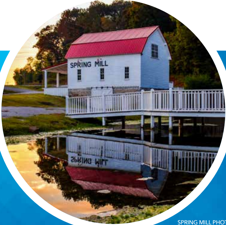
SPRING MILL